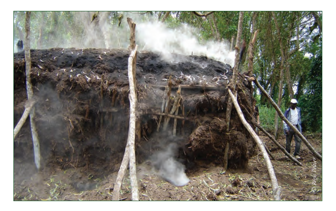
Photo 13.5: A charcoal furnace, which can operate for several weeks at a time.