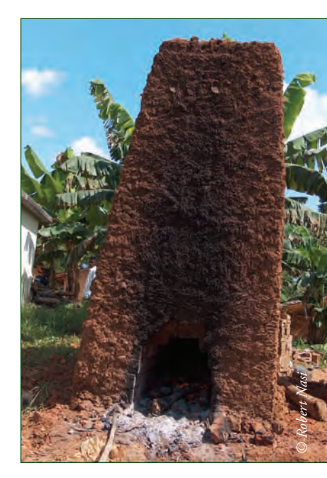
Photo 13.4: Brick manufacturing is an activity that also consumes wood energy.

faster degradation of the close resources and a rise in cost. Refining these criteria, it is possible to define a comprehensive typology, that is still qualitative and provisional. This typology allows efficient segmentation of cases encountered in the field. Then for each type of situation, it would be possible to ask the most important questions and propose the most relevant response. The benefit of this approach is to integrate information that is often fragmentary and apparently not correlated. Figure 13.1 shows an example of a segmentation based not only on the examples cited for Central Africa, but also on the analysis of situations in other regions and cities of Africa.