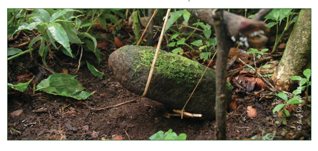
Photo 4.5: "Mole traps" are one of the many trapping systems being used in the region.