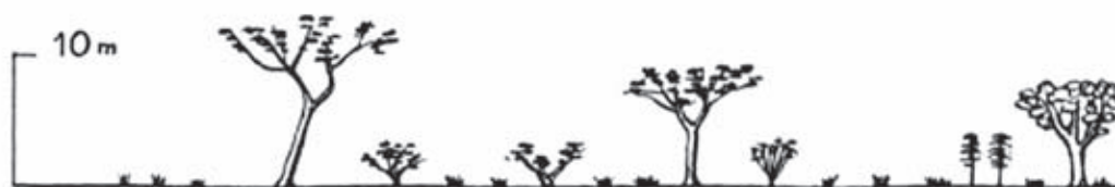
Figure 6.6: Tree and/or scrub steppe (Letouzey, 1982).