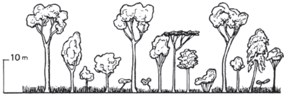
Figure 6.5: Clear forest (Letouzey, 1982).