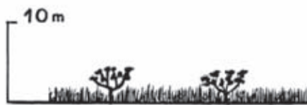
Figure 6.4: Scrub savanna (Letouzey, 1982).

placed by a bush stratum (Annex 3). The proportion of bush cover is less than 70 %.