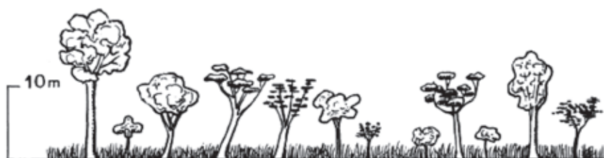
Figure 6.2: Wooded savannas (Letouzey, 1982).

gives them the name “dense semi-humid forests with Anogeissus leiocarpus - Abizia zygia ”. In the Guinean-Congolese/Zambeian transitional area, White (1986) states that the dry dense forests are scattered over the Kwango plateau (Katanga province, DRC, where they are known as “mabwati”). The timber species characteristic of the dry dense forests are listed in Annex 3.