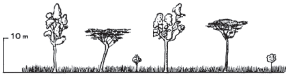
Figure 6.3: Tree savanna (Letouzey, 1982).

The scrub savannas (figure 6.4) resemble the wooded savanna but the tree stratum is re-