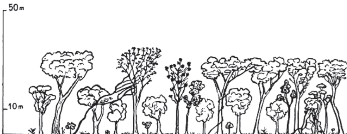
Figure 6.1: Dry dense forest (Letouzey, 1982).

The dry dense forests in figure 6.1 have little herbaceous undergrowth; this is very different from the herbaceous flora of neighboring savannas (Schnell, 1976). Rainfall is 1 000 to 1 500 mm per annum with a clearly marked dry season. Exceptionally, they may occupy dry and stony soils in wetter regions. An example of the composition of these forests in the Sudano-Guinean zone of CAR is given by Boulvert (1980); he