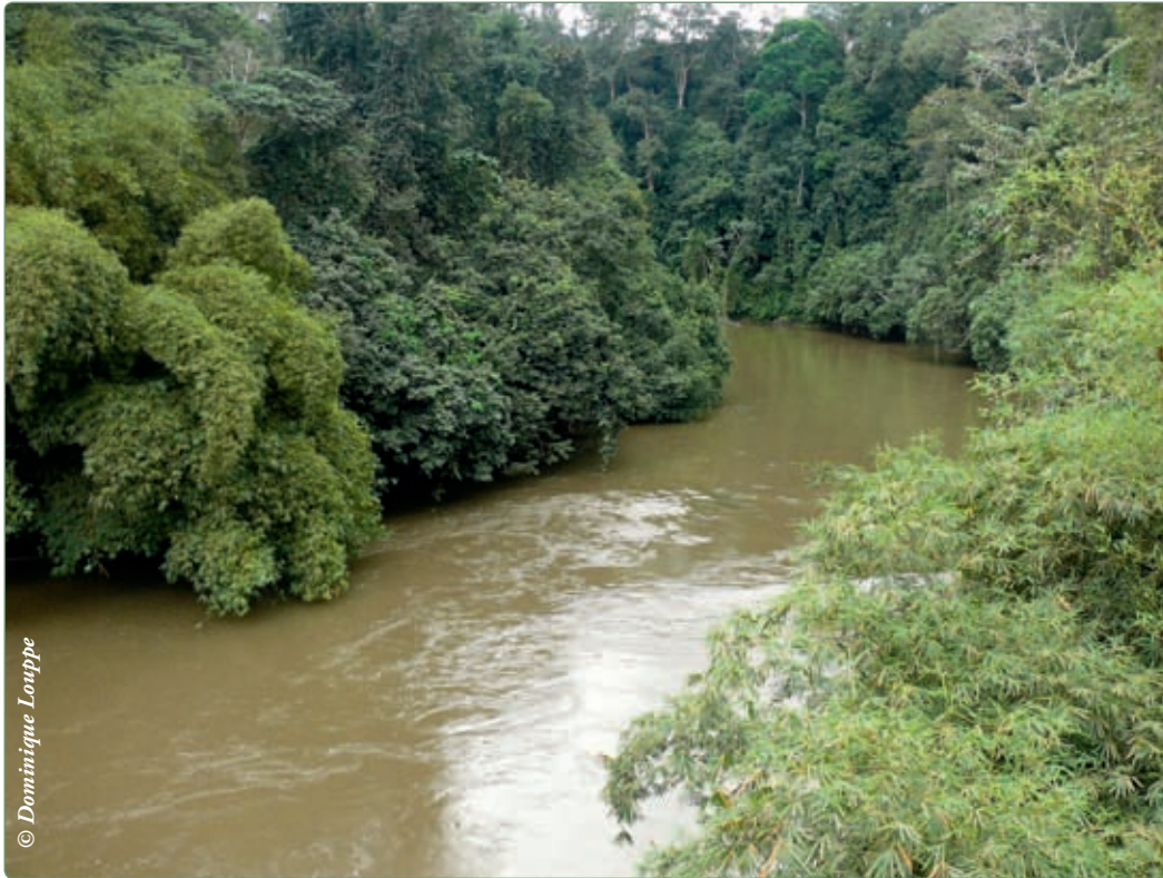
Photo 6.12: The forest maintains the quality of vital water resources