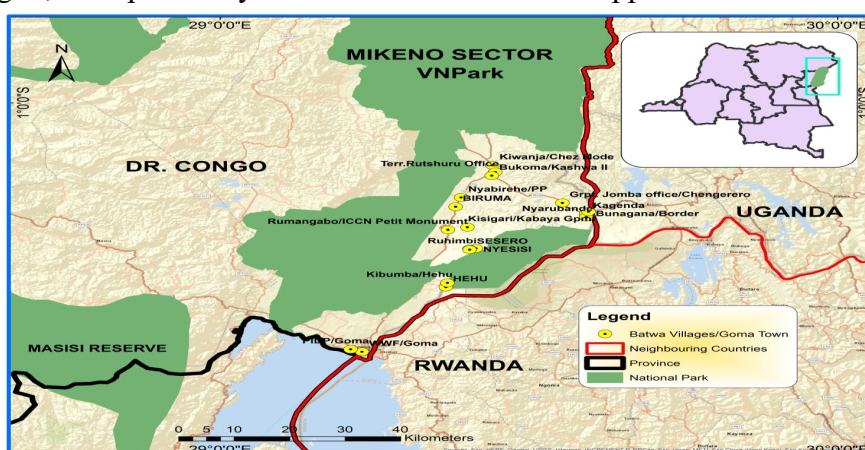
Figure 1. Map of the Mikeno Sector of the Virunga National Park and Batwa villages

This research was conducted in the Mikeno sector which is part of the Southern sector of the Virunga National park (Mikeno and Nyamulagira Mountains), 29° 21’ E-29°36’ E and 1° 20’ S- 1° 31’ S, and forms a set of the non-active Congo DR volcanoes. The Mikeno sector is contiguous to the Volcano National Park in Rwanda and the Mgahinga Gorilla National Park in Uganda. This sector corresponds to the Virunga Massif that shares borders with Rwanda and Uganda, three of which are listed as World Heritage sites with more vertebrates than any other single set of contiguous protected areas in Africa. This sector is within the North-Kivu province in the Eastern Democratic Republic of Congo. It is the Greater Virunga Landscape (GVL) in Rutshuru and Nyiragongo territories; in the Bwisha and Bukumu chiefdoms. The 5 Groupments where the research was conducted are Kibumba, Rugari, Kisigari, Bukoma, and Jomba all in the Mikeno sector. These Groupments were the targets of this study because of the number of Batwa living in, their proximity to the ViNP but also their appurtenance to the GVL.