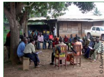
Photo 8.8: Dialogue and consultation are essential for the preservation of forest lands

Identifying a national approach, taking sub-national considerations into account, while ensuring national consolidation at the same time that would integrate various monitoring mechanisms adapted to the different scales, requires great stringency to ensure compatibility between sub-national approaches and national “carbon accounting”. The precise modalities for doing this are still to be drawn up and agreed upon but it represents one of the main difficulties in the years to come.