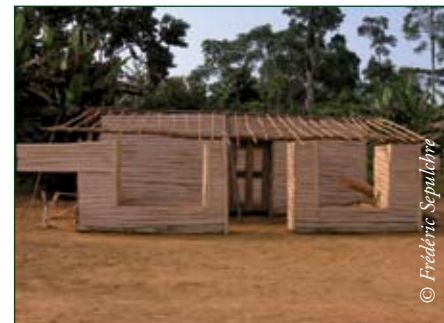
Photo 8.5: The umbrella tree ( Musanga cecropioides ) is used as building material

In conclusion, after six days of negotiations in Tianjin, it can be said that hopes had waned. It became increasingly clear that Cancún would not be able to adopt a global agreement on climate change. However, decisions on REDD+, adaptation, finance, and transfer of technology could be adopted in Cancún.