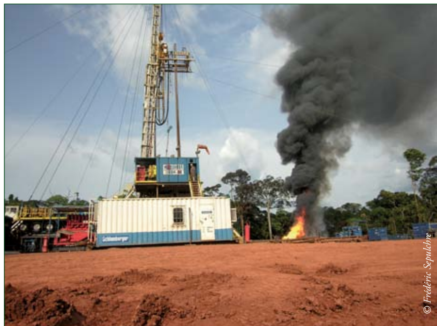
Photo 8.2: Oil exploitation also occurs in the heart of the Congo Basin forests

In Bali, the Parties agreed to extend the negotiations for two years with a view to finalizing them in 2009 at the 15 th COP session in Copenhagen. These negotiations were to allow for the adoption in Copenhagen of a legally binding agreement on climate change for the post-Kyoto 2012 period; its legal form remains open for debate.