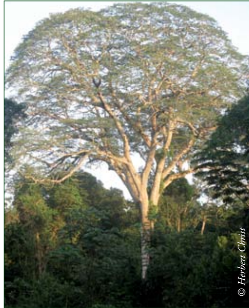
Photo 8.1: “Forest giants” are occasionally still found in forest concessions (Wijma concession in Cameroon)

Reference is made to chapter 11 of the 2008 report on the State of the Forests, “Congo Basin Countries and the Reduced Emissions from Deforestation and Degradation (REDD) Process”, which explains how the Central African Forests Commission (COMIFAC) prepared its position for the international negotiations following the 1997 Kyoto Protocol (KP) up until the conclusion of the 14 th Conference of the Parties (COP-14) in Poznań in December 2008, which preceded the Copenhagen COP-15. The following chapter continues to document this process, starting with Copenhagen and including the Cancún COP-16 (Mexico), one year before the Durban COP-17 (South Africa).