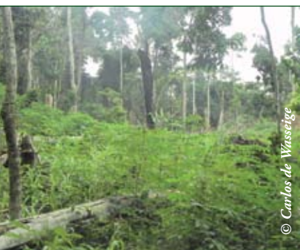
Photo 8.9: Slash and burn subsistence agriculture benefits from the richness of formerly forested soils

There is also the difficulty of ensuring supranational coherence at the COMIFAC level so that leakages from one country to another can be monitored and potentially disloyal competition can be avoided.