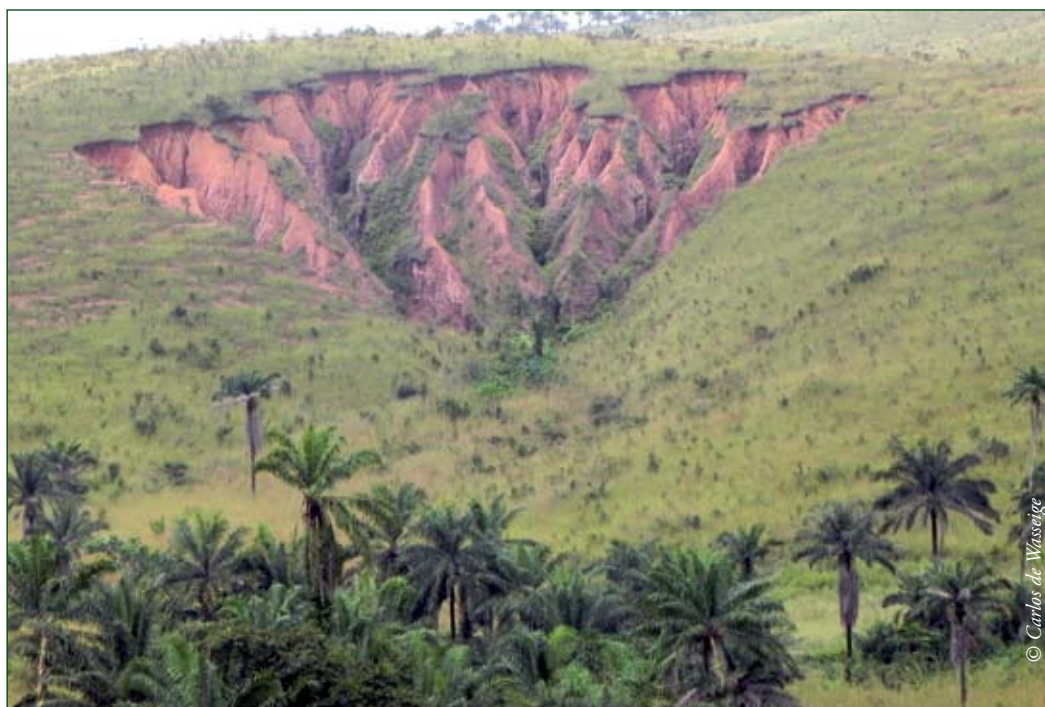
Photo 8.10: The development of erosion zones is linked to the loss of forest cover