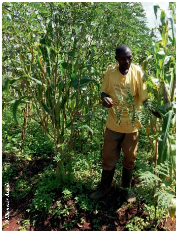
Photo 7.3: Maintaining trees on farm land generally helps maintain soil quality

Second, to overcome a number of the constraints with tree fallows, a shrub fallow was designed, using Cajanus cajan in a relay cropping system. Relay cropping basically, is an option whereby different crops are planted at different times on the same farm, and both (or several) crops grow together during part of their growing cycle. An example illustrated in photo 7.3, is planting leguminous species for soil fertility enhancement into a maize crop before it is mature. According to a review by Degrande et al. (2007), farmers responded positively to this technology because of higher crop yields, ease of clearing the Cajanus fallows, and the shading out of weeds by the shrubs. The shrub fallows were particularly appreciated by women, because the shrub fallows require less labor than other fallow systems (with perennials) and because these shrubs (which are annuals) can be planted on lease land. However, wider dissemination of tree and shrub fallows was constrained by the lack of an adequate seed supply system and poor