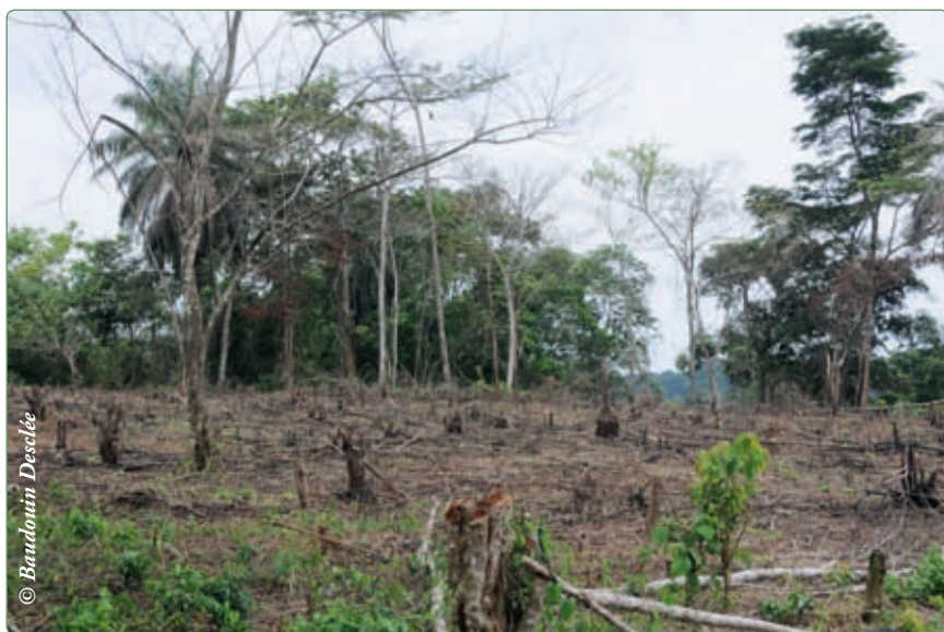
Photo 7.1: Slash-and-burn is the first step of converting forest to crop production

Land degradation following vegetation change, especially deforestation is one of the most serious problems facing global agriculture, as it affects two billion hectares (38 % of the world's cropland). Many smallholder farmers in the Central African humid tropics are trapped in a cycle of poverty, hunger and malnutrition as a result of land degradation. As a consequence, farmers continually increase the area planted for subsistence agriculture to meet food security needs, and demands for woodfuel increase with rapid population growth. The only option