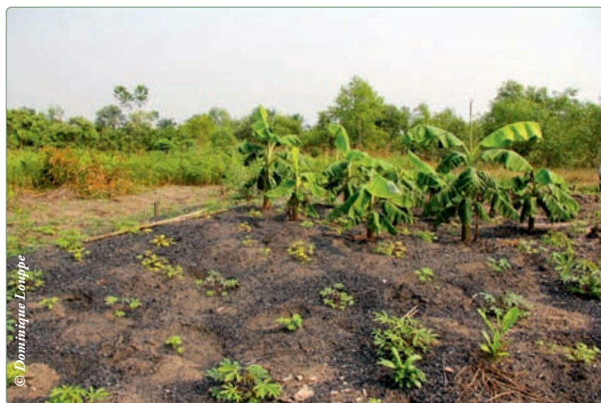
Photo 7.4: Banana and cassava cultivation on a former charcoal processing site, Bateke plateau – Mampou, DRC

Farmers have developed these strategies to become self-sufficient in food, micro-nutrients, medicines and many other daily needs (Tchoundjeu et al. , 2008). The actions by farmers to retain natural seedlings on their farms and in their home gardens, to eliminate trees with prod-